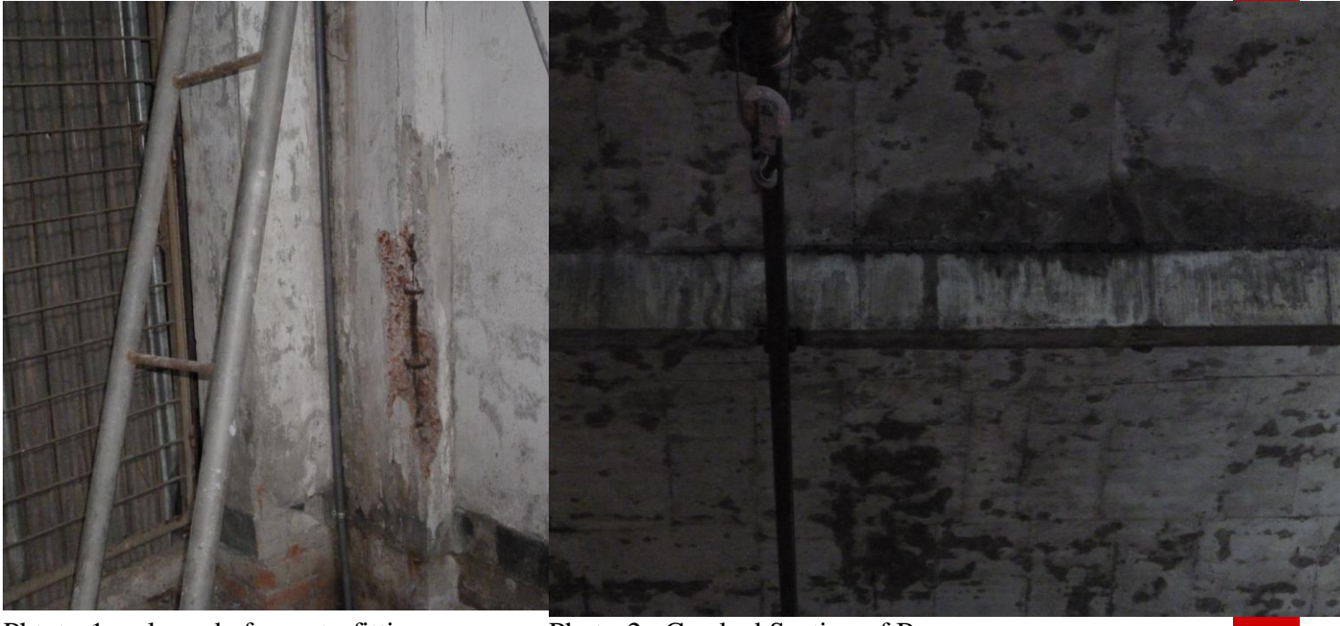
Phtoto-1: column before retrofitting